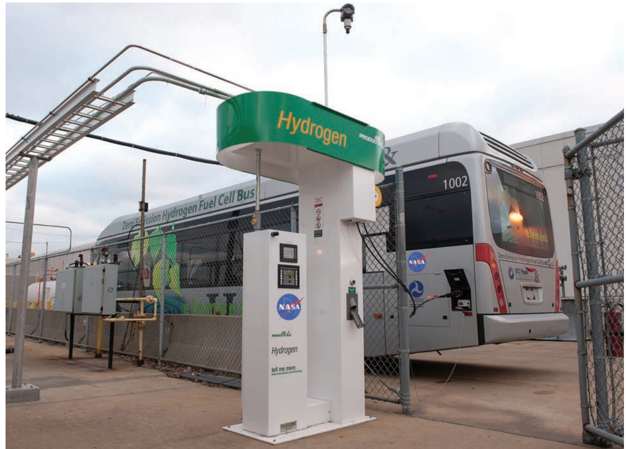
In 2012 Glenn Research Center partnered with the Greater Cleveland Regional Transit Authority (RTA) and other organizations to add a hydrogen-fueled demonstration bus to the RTA fleet. Here the bus is refueling at a station that uses an electrolyzer to convert water into hydrogen and oxygen. The vehicle's Proton Exchange Membrane (PEM) fuel cells use the hydrogen to generate electrical energy. NASA is looking to use PEM fuel cell technology to power future spacecraft.

But the particulars of PEM fuel cell design, to say nothing of the special demands placed on devices destined