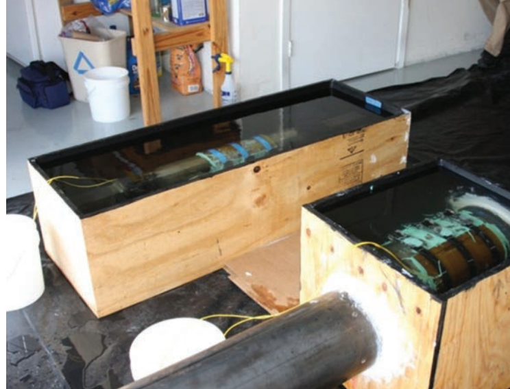
Pictured here are two tests of ATI's clamps in a NASA lab at Johnson Space Center. On the left, a proprietary coating uses friction to keep the clamp in place. On the right, a special adhesive works even underwater to bind clamps to pipes.