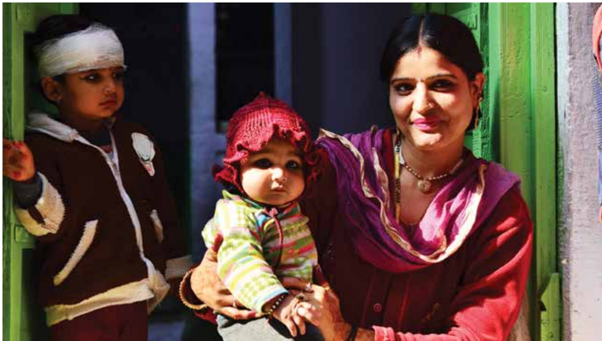
Worldwide, at least 280,000 women die each year as a result of childbirth, with PPH accounting for nearly 70,000 of those deaths. The NASA-derived LifeWrap, which costs about a dollar per use, has been shown to reduce PPH-caused mortality by 50 percent.

After using a modified G-suit to successfully treat a woman suffering from postpartum hemorrhage (PPH), NASA Ames scientists performed research in the 1970s and '80s to gain a better understanding of how pressure garments can counteract blood loss. Their work informed the first commercial noninflatable anti-shock garments, which the Safe Motherhood Program has since used in low-resource settings around the world to save lives.