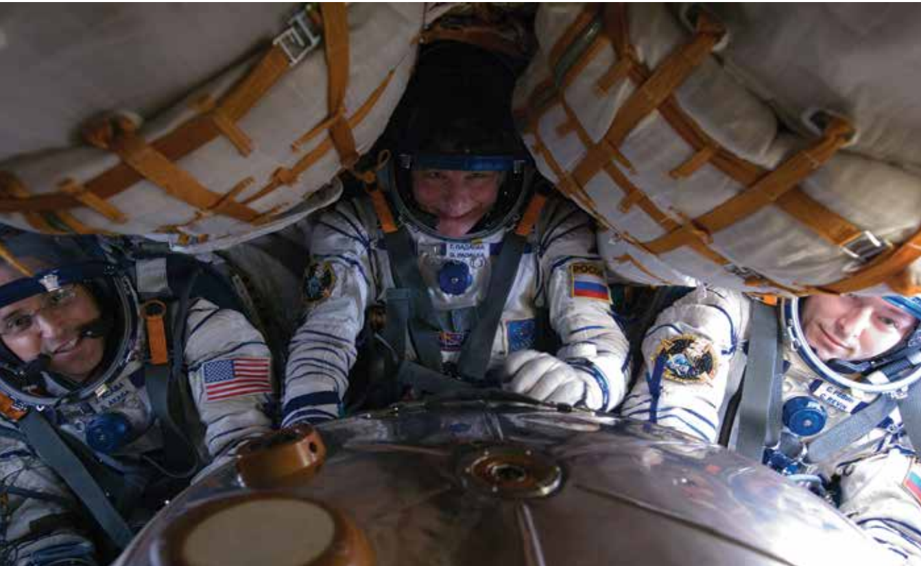
From the left: Astronaut Joe Acaba and Russian cosmonauts Gennady Padalka and Sergei Revin aboard the Soyuz spacecraft preparing for their return trip to Earth from the ISS on September 17, 2012. Upon reentry into Earth's atmosphere, gravity pulls blood away from the head and into the lower body, which can cause dizziness. As a preventive measure, crewmembers wear G-suits, which are rubberized suits that squeeze the arms and legs to push blood back toward the head.