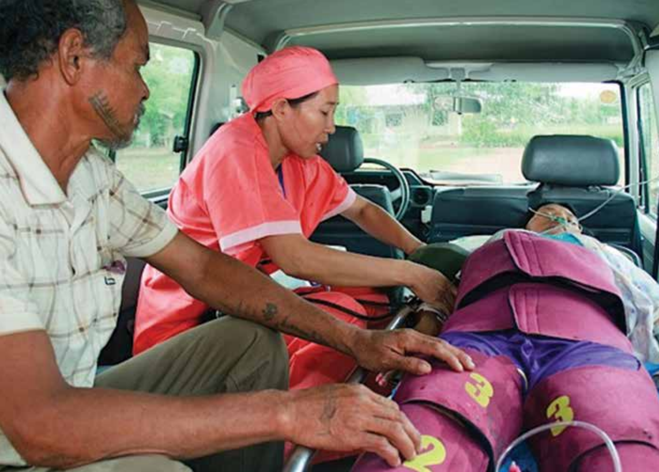
In Cambodia, the LifeWrap is applied to a woman suffering from PPH to reduce blood loss until she reaches a hospital for treatment.