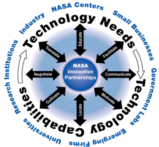
Figure 1. NASA’s Innovative Partnerships Program is engaged in a dynamic process to match technology needs with capabilities.

IPP also seeks solutions to some of NASA’s pressing technical challenges by funding Small Business Innovation Research and Small Business Technology Transfer projects; seeking cost-shared, technology development partnerships through the IPP Seed Fund; and tapping into new sources of innovation through NASA’s Centennial Challenges prize program. IPP seeks to facilitate and catalyze innovative partnerships in two directions: technology infusion to provide technical solutions to some of the challenges being faced by NASA’s programs and projects; and technology transfer—or spinoffs—to provide solutions to technical challenges in the private sector or other Government agencies with NASA-developed technology. In short, IPP is seeking to match technology needs with technology capabilities 2 , as illustrated in Figure 1. IPP achieves these objectives through a nationwide network of offices across NASA’s 10 field centers.